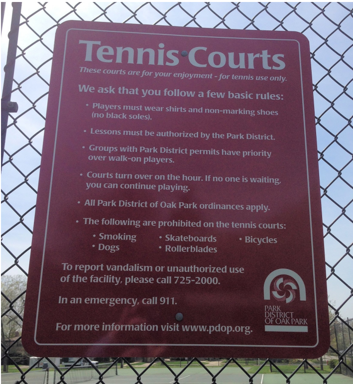
Examples of Park & Facility Rule Signage