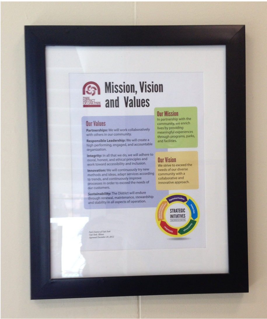
Example of Mission, Vision, and Values Posted in District Facilities